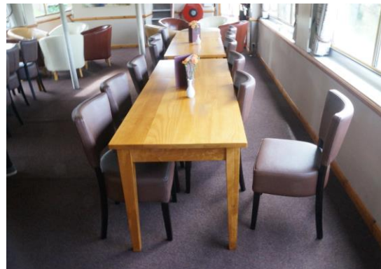
Dining tables and chairs