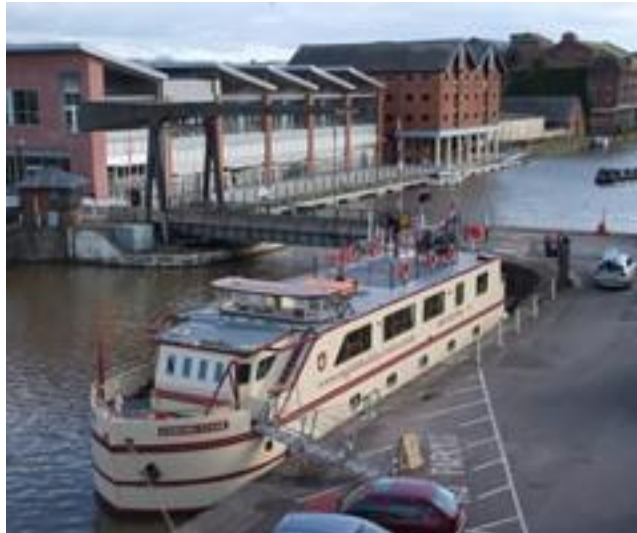
Edward Elgar at Gloucester mooring