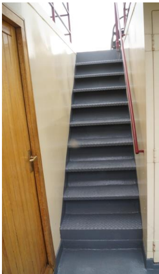
Steps to top deck