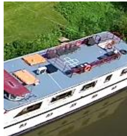
Birds eye view of top deck